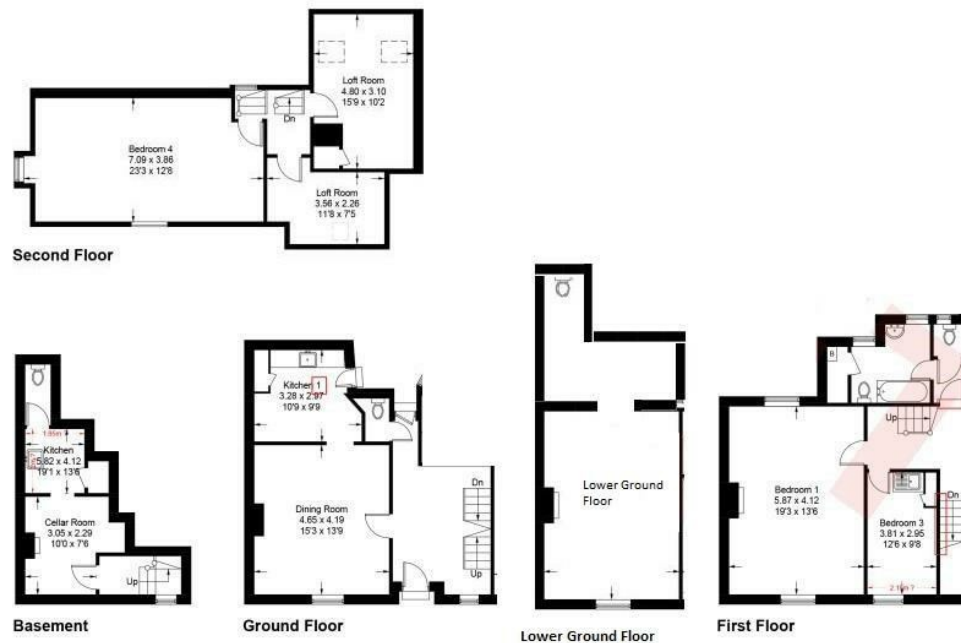
Illustration for identification purposes only, measurements are approximate, not to scale. floorplansUsketch.com © (ID875399)